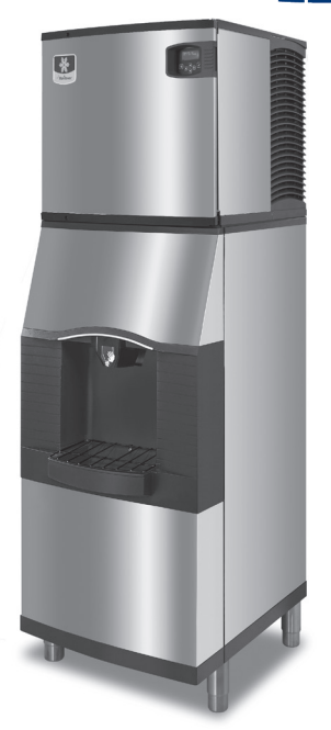
Indigo Series 522 Ice Machine SPA-160 Ice Dispenser

Ice only dispense, with coin-op and room card dispensing control options