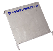
K00482 - Hanger (required with K00461)